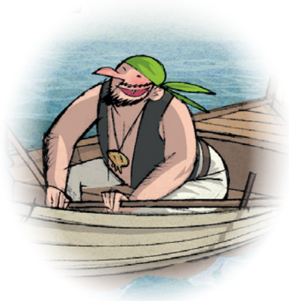
Illustration Pablo Torrecilla